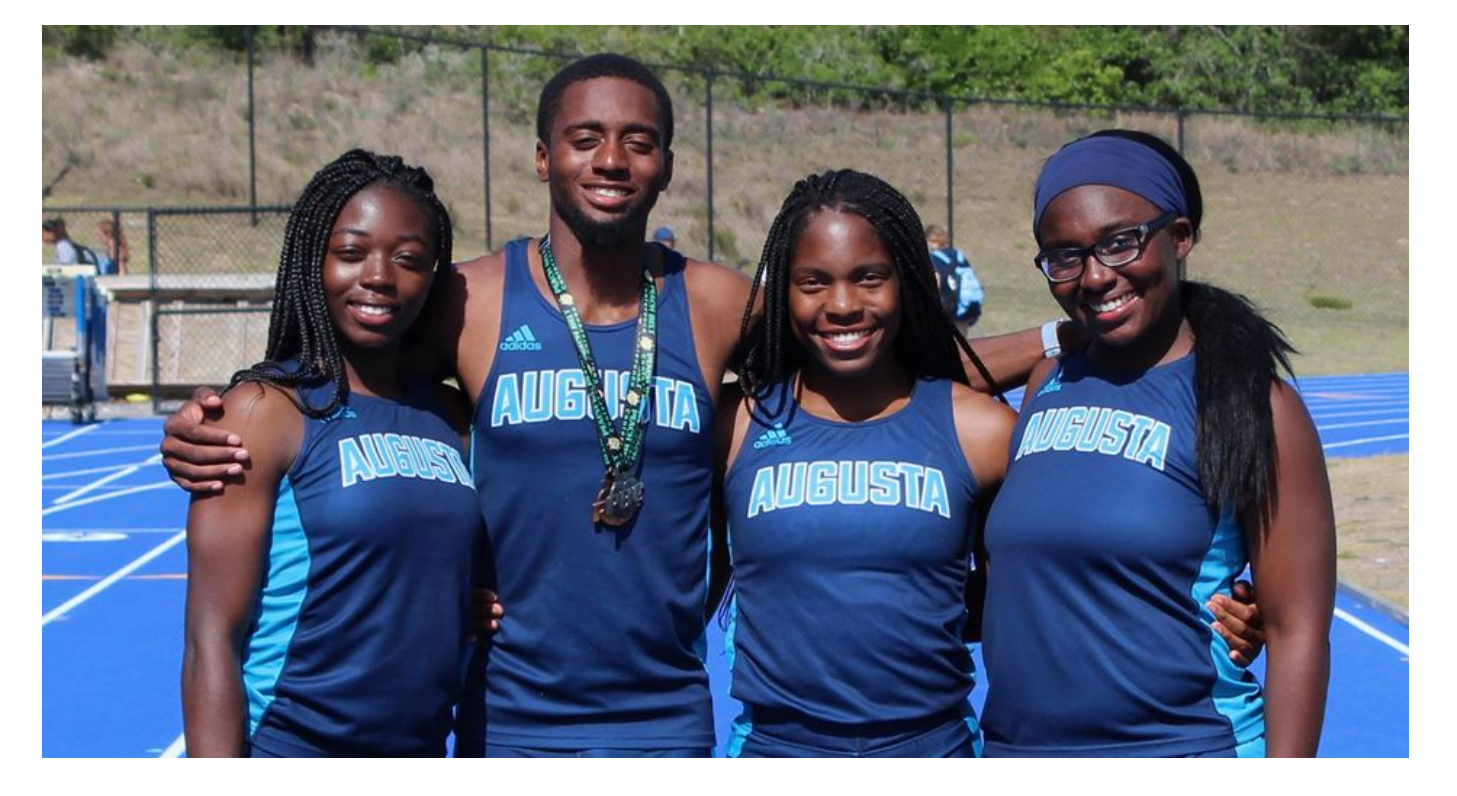
Women's Track and Field 4/25/2022 11:08:00 AM