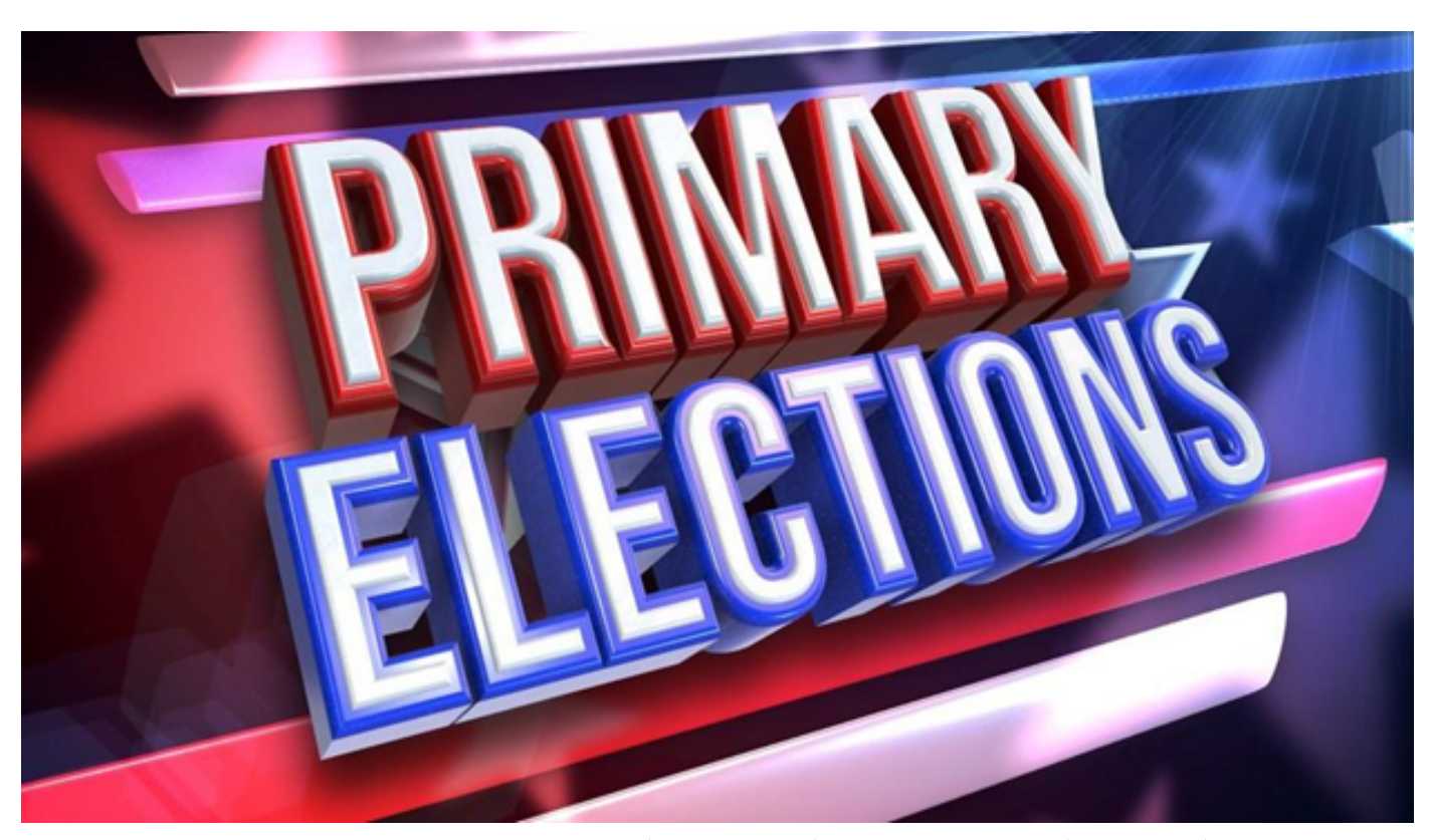
Voting Begins October 17th - November 4th