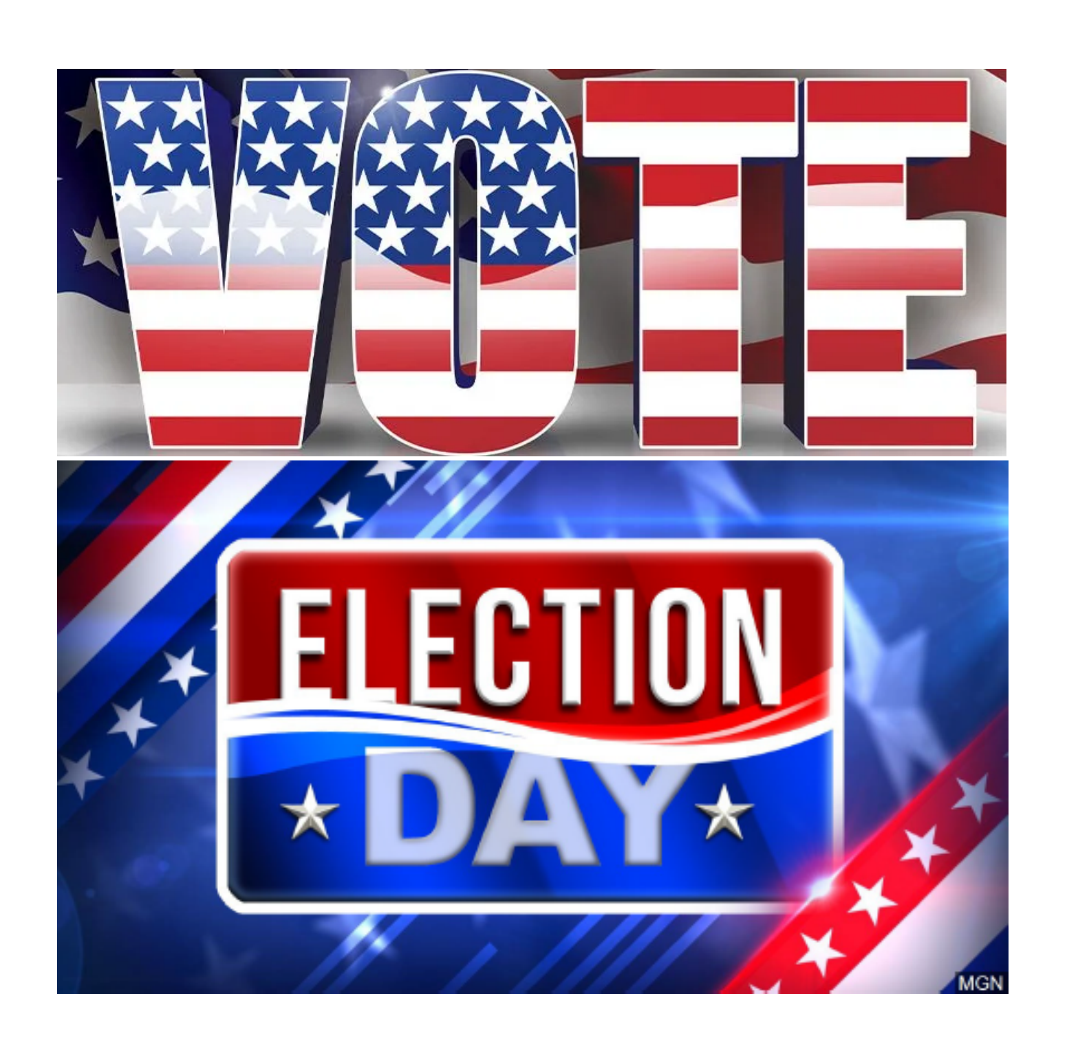
Tuesday, November 8th